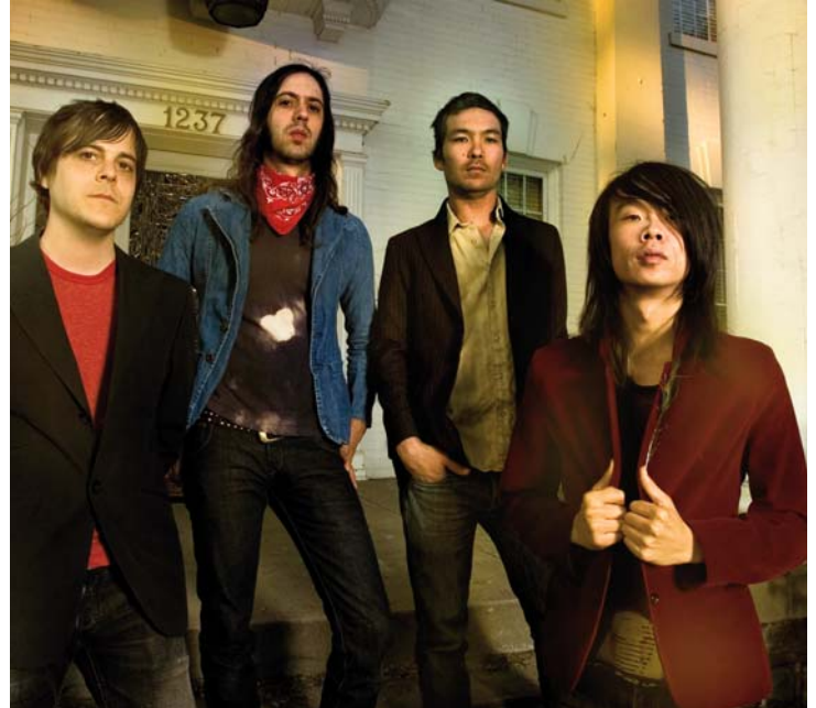
VHS OR BETA